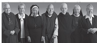
Meet them at retiredreligious.org/2018photos .