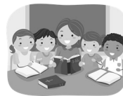
Religious Education Tuition

These are some new icons to look for on our online giving website for some of our familiar donations: