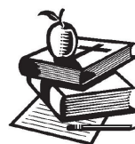
Religious Education Donation

The Assumption of the Blessed Virgin Mary