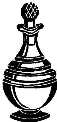
OIL OF THE SICK

The final oil, chrism, is a mixture of olive oil and balsam, a fragrance from the Holy Land. Chrism receives its name from Christ, as do we who are Christians, because we have been anointed with this oil. The prayer is quite rich as it recalls the song of David and the anointing of Aaron as priest;