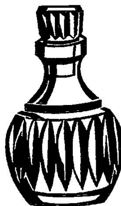
OIL OF THE CATECHUMENS